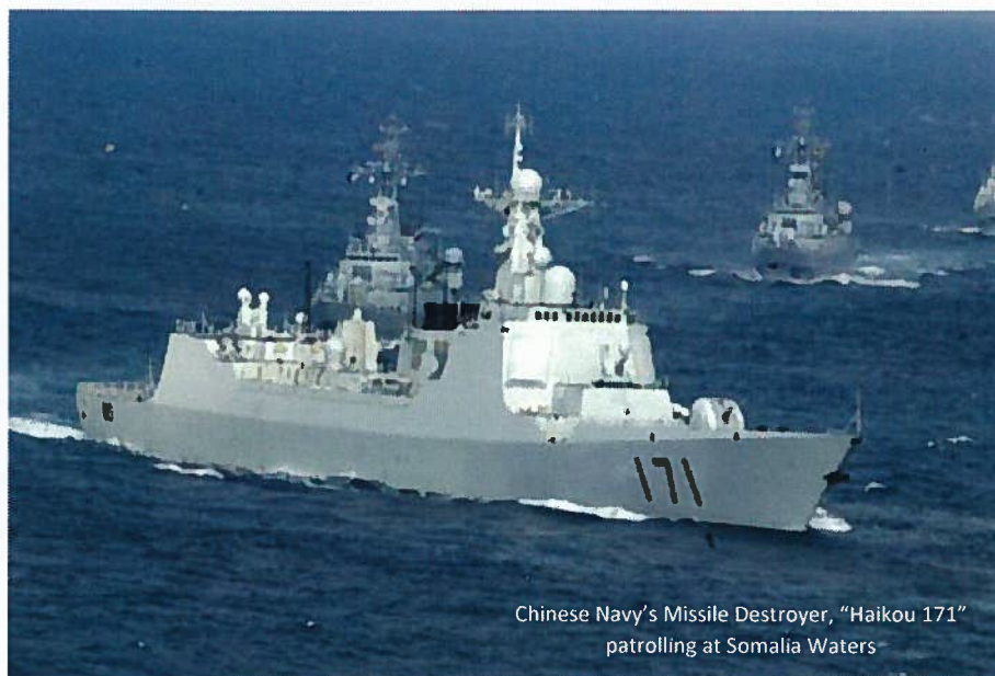
Chinese Navy's Missile Destroyer, "Haikou 171" patrolling at Somalia Waters

The world's maritime countries are stepping up security in the troubled waters off Somalia.