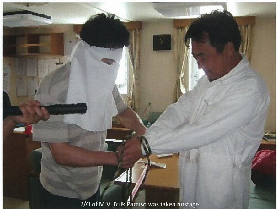
2/O of M.V. Bulk Paraiso was taken hostage

The exercise brought awareness to all the shipboard staff and prepare them to handle piracy prevention.