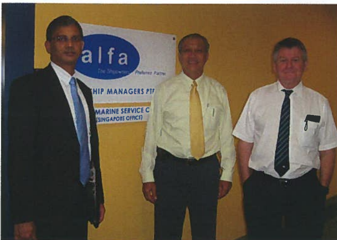
International Registries' (Hong Kong Office) Technical Marine Manager & Fleet Operations Manager with Alfa Chief Operating Officer