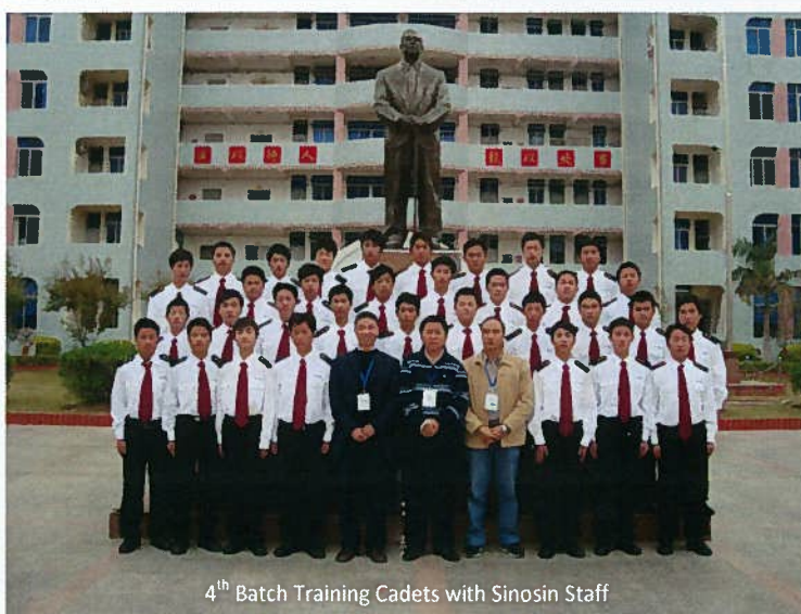
4 th Batch Training Cadets with Sinosin Staff