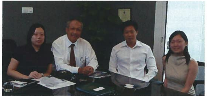
Alfa Commercial Representatives with International Registries' Branch Manager & Assistant Officer

It is noted that Marshall Islands Registry has been growing in commercial shipping. Previously, Marshall Islands was popular registry for pleasure vessels and craft.